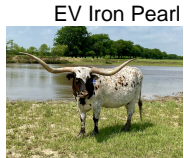
EV Iron Pearl